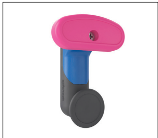
EuroV2 Moulded Bag Hooks