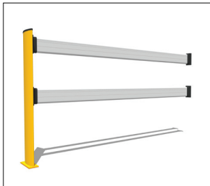
FS2400 Inline Rail Extensions