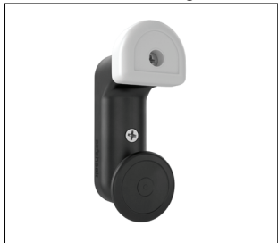
Cast Aluminium Ihook-AI