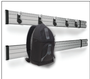
Stowmate WM BagTrac