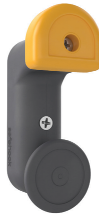
OZIhook Bag Hook * Stowmate® Compatible * All Non Combustible Options