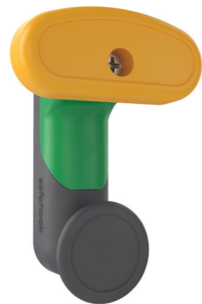
EURO V2 Bag Hook * Stowmate® Compatible

Safehook's Manufactured and Designed in Australia.