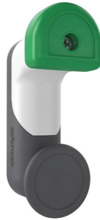
Ihook Mk2 Bag Hook * Stowmate® Compatible