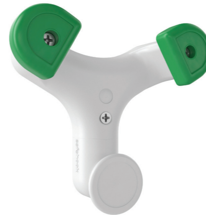
OZYhook Bag Hook