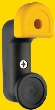
Oz I Hook