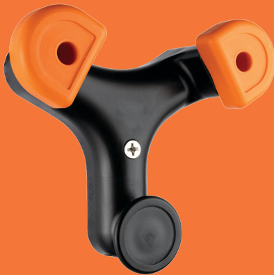
Oz Y Hook